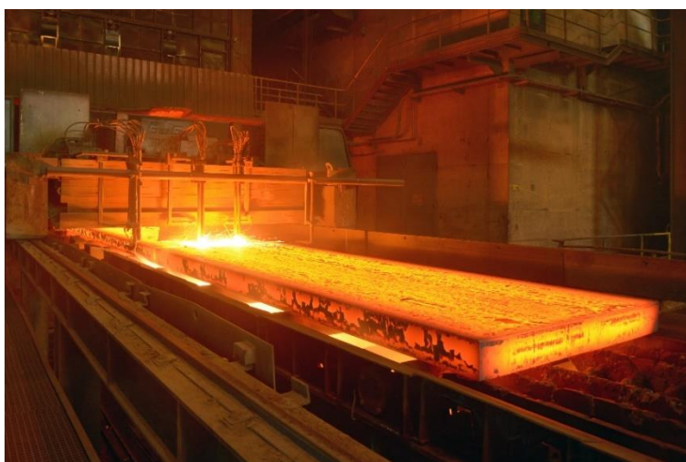
Fig. 1. Steelworks of Liberty Częstochowa Sp. z o. o.

The Steelworks of Liberty Częstochowa Sp. z o.o. produces semi-finished products for hot processing. The production range includes: non-alloyed, low-alloyed and alloyed steel slabs and blooms delivered in "as cast" condition. The semi-finished products are made in production routes: Electric Arc Furnace (EAF), secondary metallurgy (LF/VD/VOD), Continuous Casting (CCM).